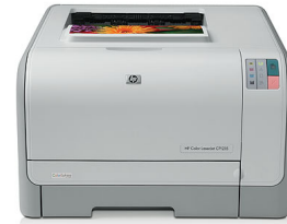
HP CLJ CP1215